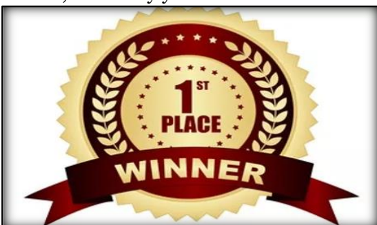
Prize for every 1 st student.