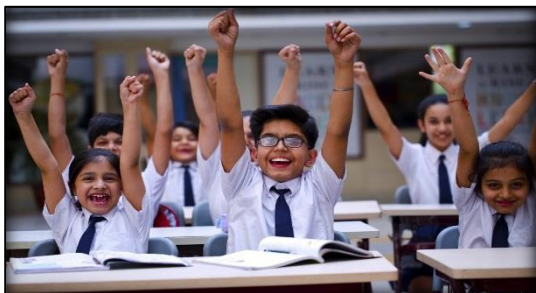
Very easy to understand study