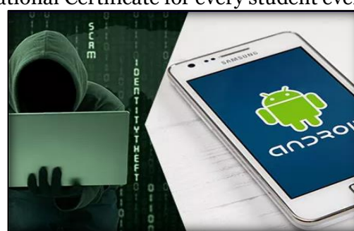
Free Cyber Security awareness