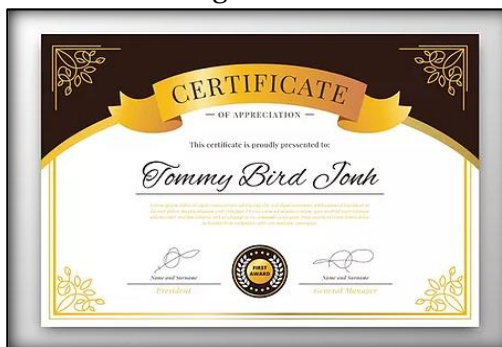
National Certificate for every student every year