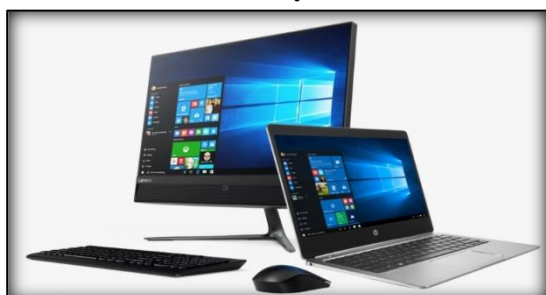
Desktop/laptop for district topper.