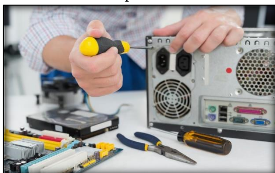
10,000 every year for maintenance