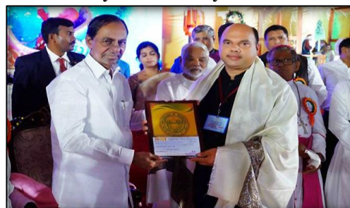
Award district topper's HM