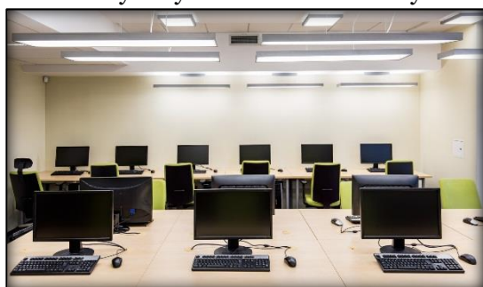
Free computers for lab.